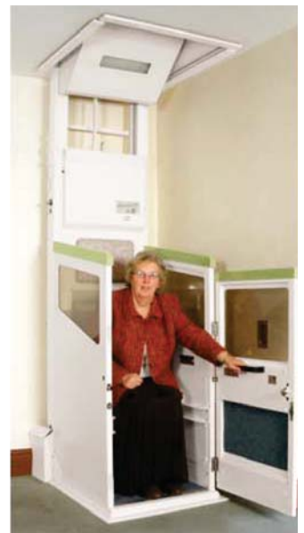
Harmony Compact at lower level with fixed seat.