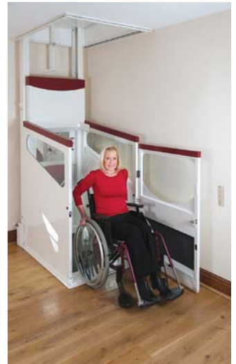
Harmony allows you to move between floors smoothly and safely. Can be used with or without your wheelchair. Fold-up seat available.

Operation is simple. Having called the lift from the easily accessible wireless wall control (with no unsightly plastic trunking), sited to suit the user, the car door can be opened by the same control. The low integral ramp allows easy wheelchair access and a push button inside the car closes the door. A push of the car control button (which can be positioned by the user to suit their needs - not available on the Compact model) will signal the car to travel to the other floor, automatically lifting or replacing the aperture ceiling panel en route, where the reverse procedure is followed to exit the car.