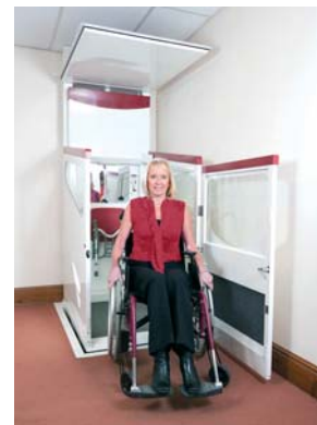
Entering the lift upstairs

Both lift-up aperture infill and car underpan are designed to provide a minimum half hour fire protection and both are fitted with smoke and intumescent fire seals. Pressure sensitive safety surface is incorporated in the floor aperture infill which will stop the lift if it is obstructed.