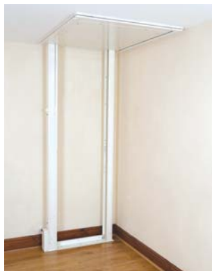
Lower room when lift upstairs