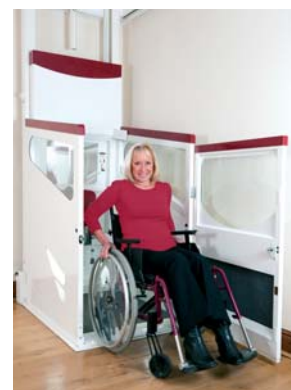
Exiting the lift downstairs