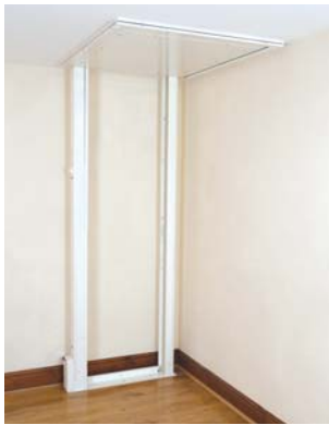
Lower room when lift upstairs