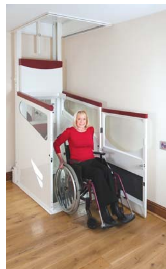
Harmony allows you to move between floors smoothly and safely. Can be used with or without your wheelchair. Fold-up seat available.

Operation is simple. Having called the lift from the easily accessible wireless wall control (with no unsightly plastic trunking), sited to suit the user, the car door can be opened by the same control. The low integral ramp allows easy wheelchair access and a push button inside the car closes the door. A push of the car control button (which can be positioned by the user to suit their needs - not available on the Compact model) will signal the car to travel to the other floor, automatically lifting or replacing the aperture ceiling panel en route, where the reverse procedure is followed to exit the car.