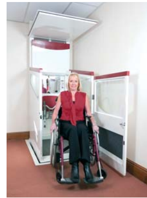
Entering the lift upstairs

Both lift-up aperture infill and car underpan are designed to provide a minimum half hour fire protection and both are fitted with smoke and intumescent fire seals. We are the only manufacturer to provide this important safety feature as standard in both the up and down positions. Pressure sensitive safety surface is incorporated in the floor aperture infill which will stop the lift if it is obstructed.