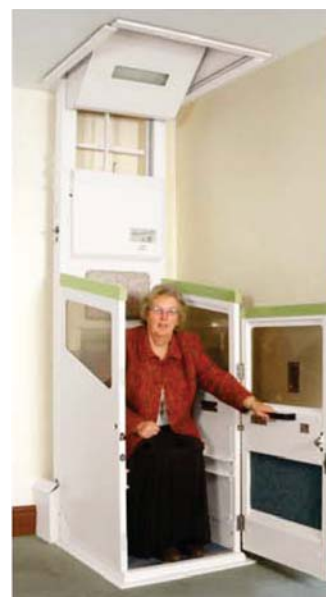
Harmony Compact at lower level with fixed seat.