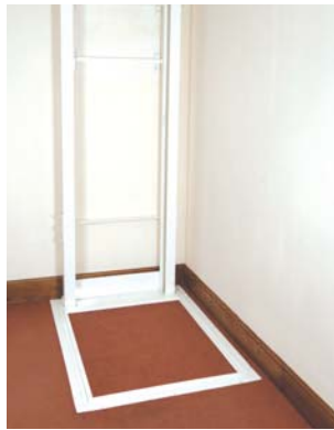
Upper room when lift downstairs