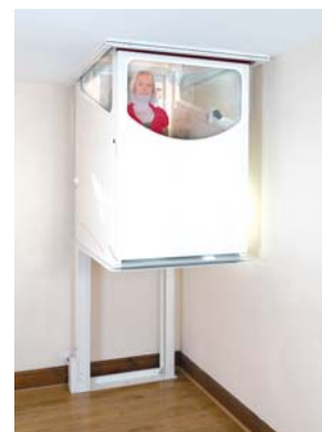
Lift approaching lower floor